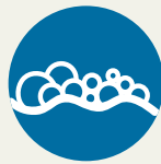
Foaming 1 & Agitation